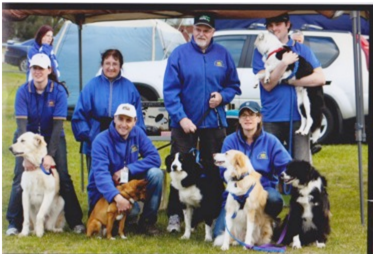
The 2010 Frankston Flyball Team

Brodie was a champion flyball dog. In his heyday he was one of the fastest height dogs in the state running low 4 seconds over 11" jumps. Brodie loved life and lived it to the fullest every day. At flyball he was a nutcase, barking and straining on the lead desperate to get into the ring. At home he was a spoilt family member who loved spending time with his family. He could chase a ball for hours, and knew which ball was his. You could throw his ball into the children's ball pit and he would dive in and emerge with his tennis ball, leaving all the children's balls untouched! He will be dearly missed, both by his family and by the entire flyball community. RIP Brodes!