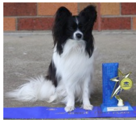
Minx, 195 points Novice Obedience

was greatly appreciated by all recipients. DogSmart also provided Tug-E-Nuff toys for some. A "thank you" goes to our trial sponsor, DogSmart and trial supporters The Pet Food Co, Tough Dog Beds, Strike Bowling, APCO, Carrum Downs Pet Clinic and Carjack, a stalwart for our club. There will be those that I have missed but everyone's support is appreciated. Also an expression of appreciation to our Judges, Stewards, volunteers on, before and after the event and those who entered.